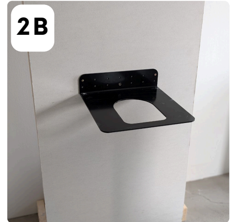
2B OPTION 2: INSTALL BRACKET DIRECTLY OVER DRYWALL OR TILE, THROUGH TO SECURE STUD AND USING PROPER ANCHORS WHERE NECESSARY