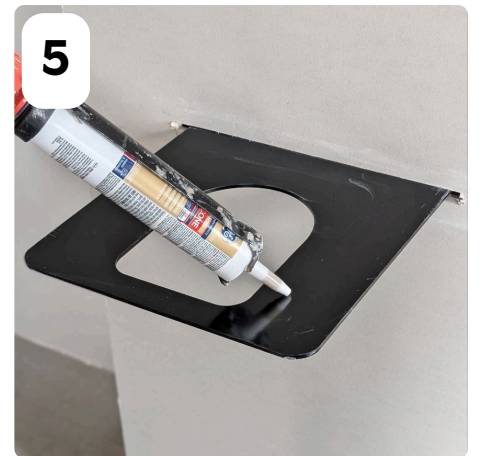
5 APPLY SILICONE TO TOP OF BRACKET. THEN CAREFULLY PLACE SINK IN ITS INTENDED LOCATION, ALIGNING SINK OVER BRACKET CENTER.