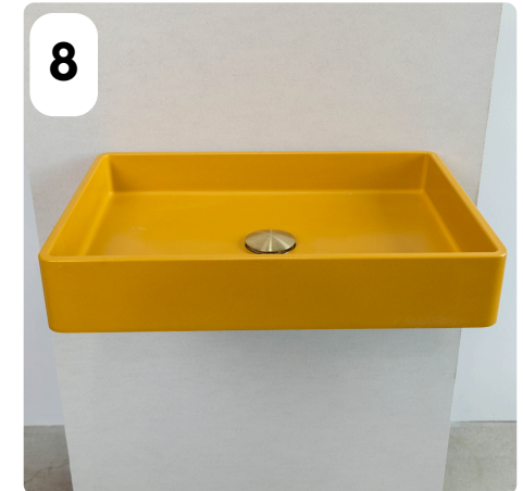
8 REMOVE EXCESS PUTTY, ALLOW SILICONE TO DRY FOR 24 HOURS BEFORE USE