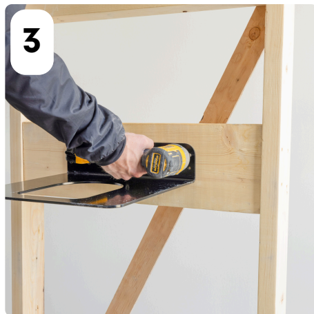
3 USE MINIMUM 4 HOLES TO SECURE BRACKET TO CHOSEN BACKING. IF USING ANCHORS, ENSURE AT LEAST ONE STUD IS USED IN CONJUNCTION WITH ANCHORS