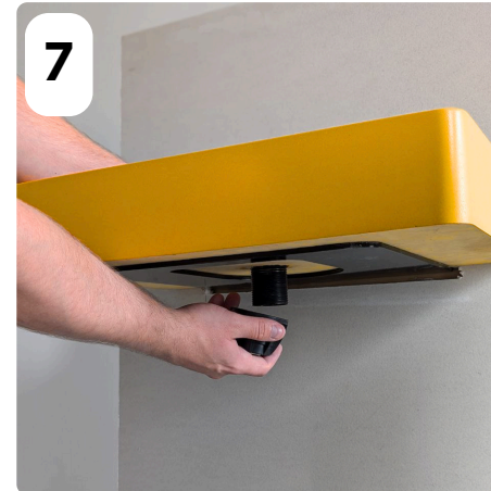
7 SLIDE DRAIN INTO PLACE, HAND-TIGHTEN. DO NOT OVERTIGHTEN