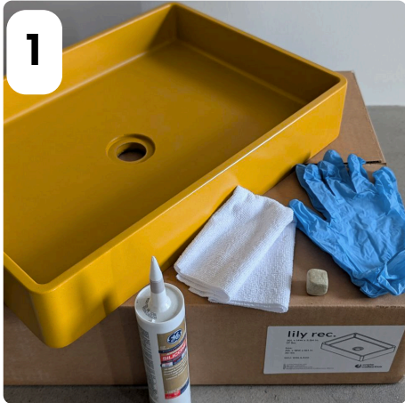
1 REMOVE SINK FROM BOX AND PUT IN INTENDED SPACE. GATHER GLOVES, BATHROOM SILICONE, CLEAN CLOTHS, AND DRAIN ASSEMBLY

BELOW YOU'LL FIND STEP BY STEP INSTRUCTIONS TO ENSURE A SUCCESSFUL INSTALLATION. WHILE YOU CAN EASILY INSTALL THIS NEW SINK YOURSELF, CRETE SUGGESTS ALWAYS HIRING A TRAINED PROFESSIONAL FOR INSTALLATION TO MITIGATE ANY POTENTIAL ISSUES. CRETE COLLECTIVE CANNOT BE HELD LIABLE FOR ANY DAMAGES OR INJURY ARISING FROM IMPROPER INSTALLATION OF THE SINK. IT IS CRUCIAL TO FOLLOW THE PROVIDED INSTRUCTIONS CAREFULLY AND REFRAIN FROM OVERTIGHTENING THE SINK DURING INSTALLATION.