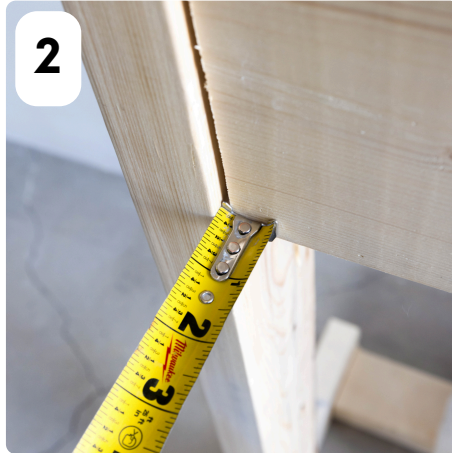
2 OPTION 1: INSTALL A CROSS MEMBER BETWEEN STUDS, RECESSED 1/4" FROM FLUSH FACE OF STUD. THIS ALLOWS ROOM FOR MOUNT TO NOT INTERFERE WITH DRYWALL INSTALLATION